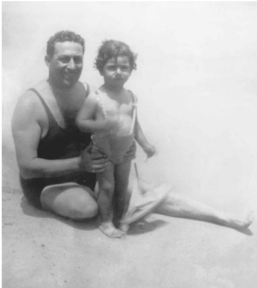
With my father on the beach at Alexandria, 1936