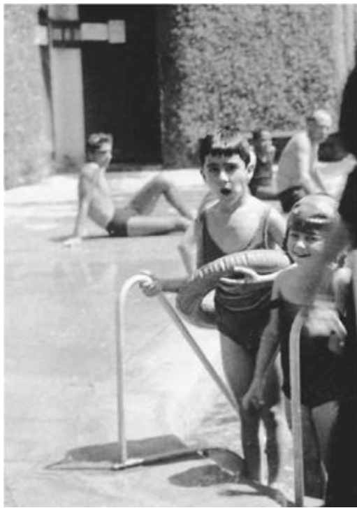
Age five, at the Maadi Sporting Club pool, 1940