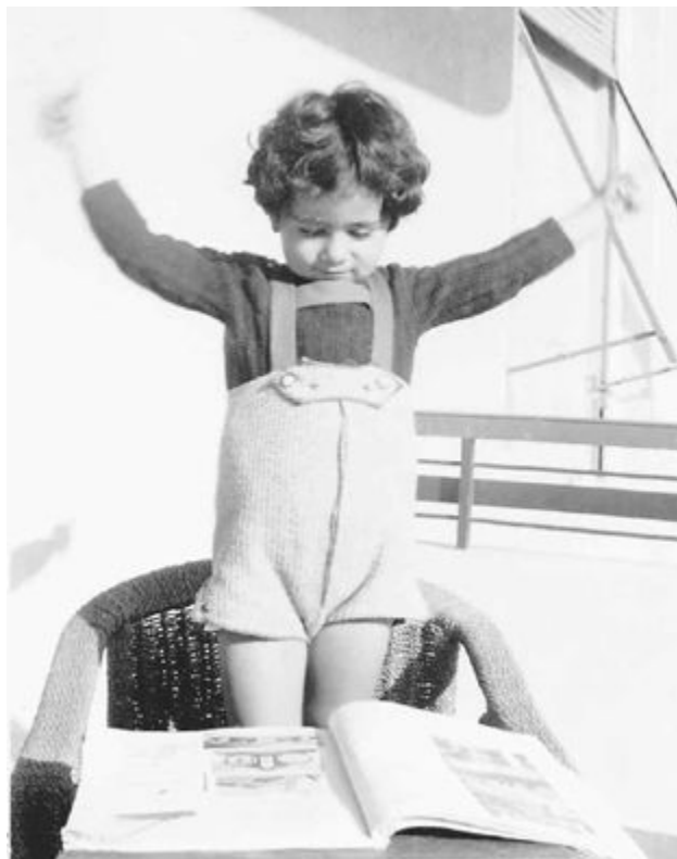
Displaying early conducting skills on the terrace of the Cairo apartment on Aziz Osman Street