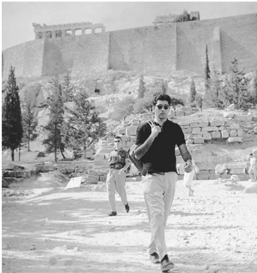
A summer during graduate school at Harvard: at the Acropolis, Athens, 1960