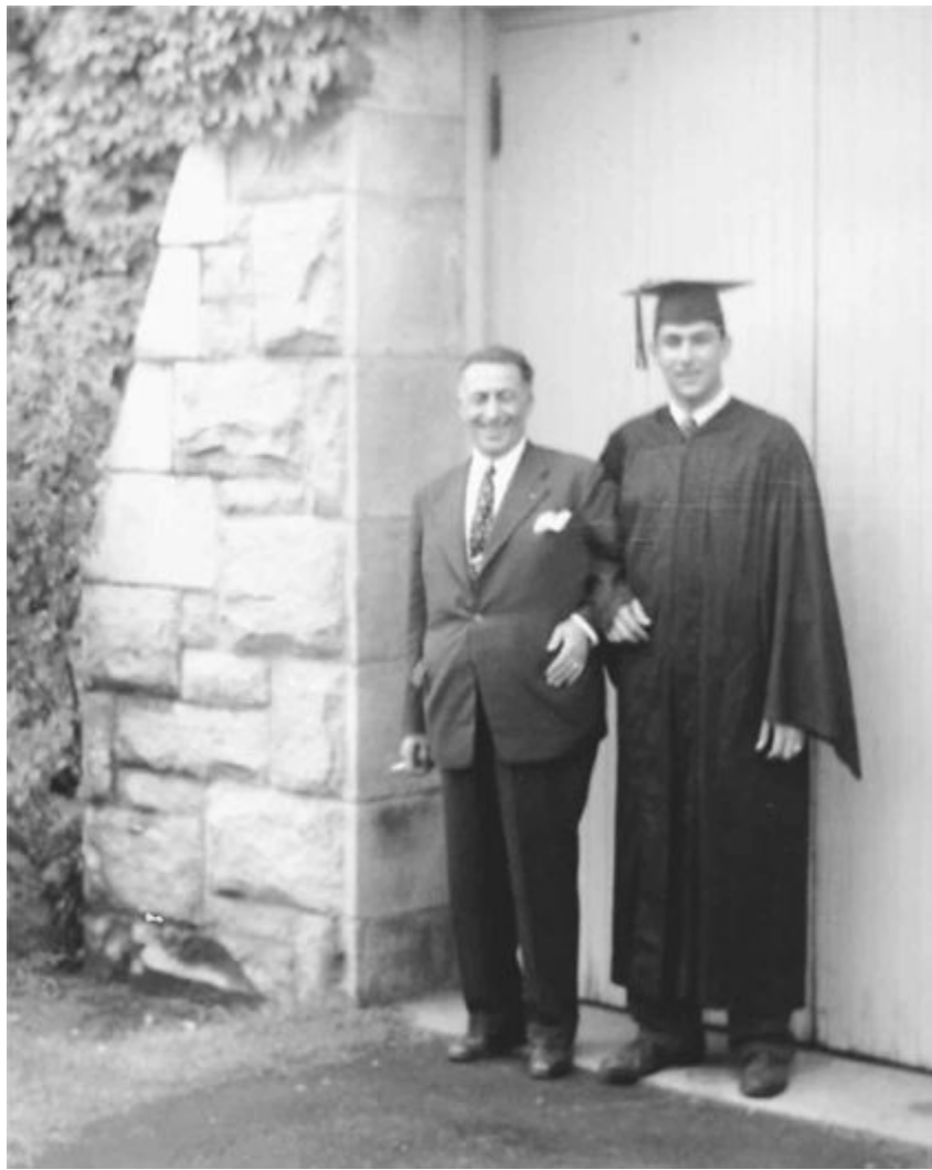
With my father at graduation from Mount Hermon, June 1953