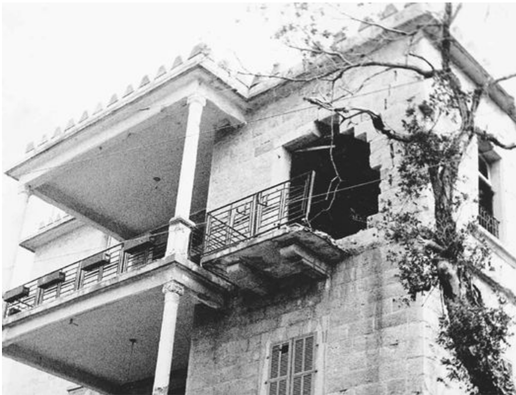
A 1980 view of the summer house rented from 1946 to 1969 in Dhour el Schweir. The rocket hole made during the Lebanese Civil War went through the master bedroom.