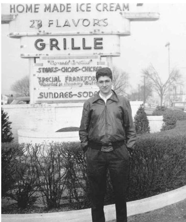
In front of Howard Johnson's in Jamaica, New York, March 1951