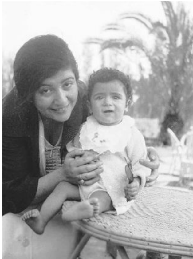
My mother and me, age one, in the Mena House gardens