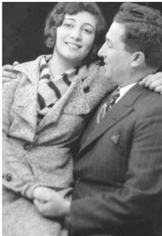
My parents on their honeymoon in London, January 1933